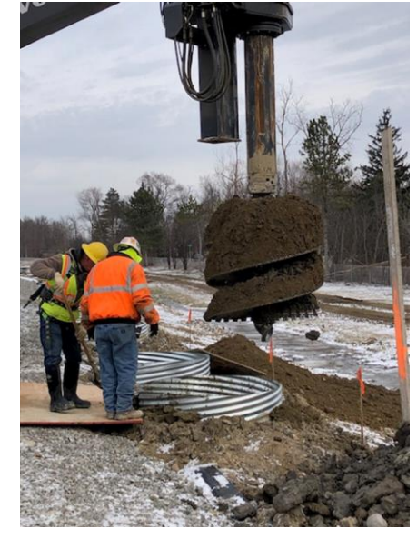
Winter Sound Wall Foundation Work - Drilling holes with auger