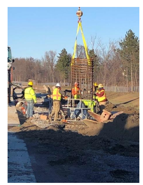
Winter Sound Wall Foundation Work - Placing & Installing pre-tied cages