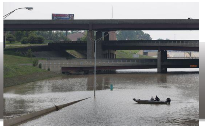
Michigan State Police boat patrols on I-75 at I-696 in August 2014