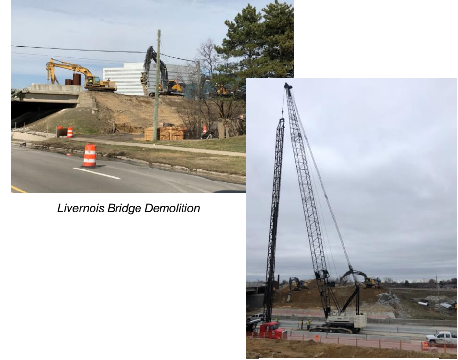
Lifting Pile at Big Beaver