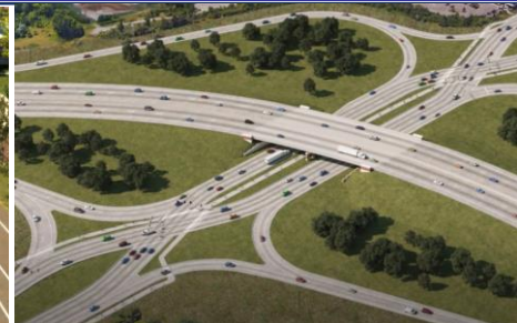
Big Beaver Diverging Diamond Interchange